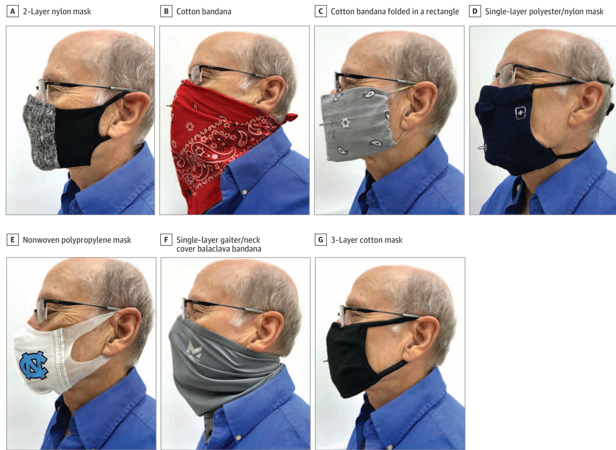
Figure 1. Consumer-Grade Masks and Improvised Face Coverings

The face coverings tested in this study included a 2-layer nylon mask with ear loops (54% recycled nylon, 43% nylon, 3% spandex), tested with and without an optional aluminum nose bridge and filter insert in place (A), a cotton bandana folded diagonally once “bandit” style (B), a cotton bandana folded in a multilayer rectangle according to the instructions presented by the US Surgeon